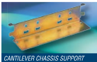
CANTILEVER CHASSIS SUPPORT