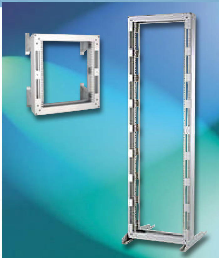
WALL AND FLOOR STANDING COMMSRAK