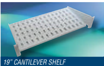
19" CANTILEVER SHELF

19" Cantilever Shelf – These shelves are 250mm deep, fix directly to the standard 19" panel mounts and occupy 2 of rack height. Nominal load per shelf is 20KG. (Material: 1.6mm steel, Finish: Painted RAL 7035 Pale Grey)