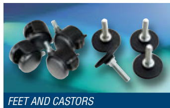
FEET AND CASTORS