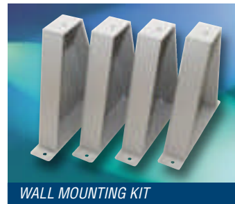
WALL MOUNTING KIT