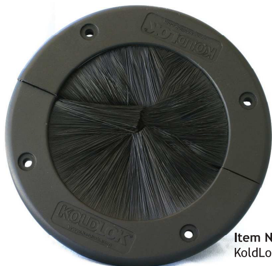
Item No.40001 KoldLok Round 4"